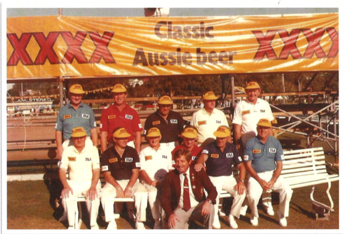
WORLD FIRST 1985 PLAYERS ASSEMBLED ON COOLANGATTA GREEN BEFORE THE MASTER OF MASTERS TOURNAMENT

So, with the sanction of Smasher and my fellow members, I bit the bullet and bought 3 dozen coloured shirts and had the names and logos of the sponsors sewn on them. We quietly met with the players and, though some of them were a little cautious, they agreed to don the shirts for the tournament. For the first time in the world coloured shirts, with sponsors' names were worn on a bowling green.