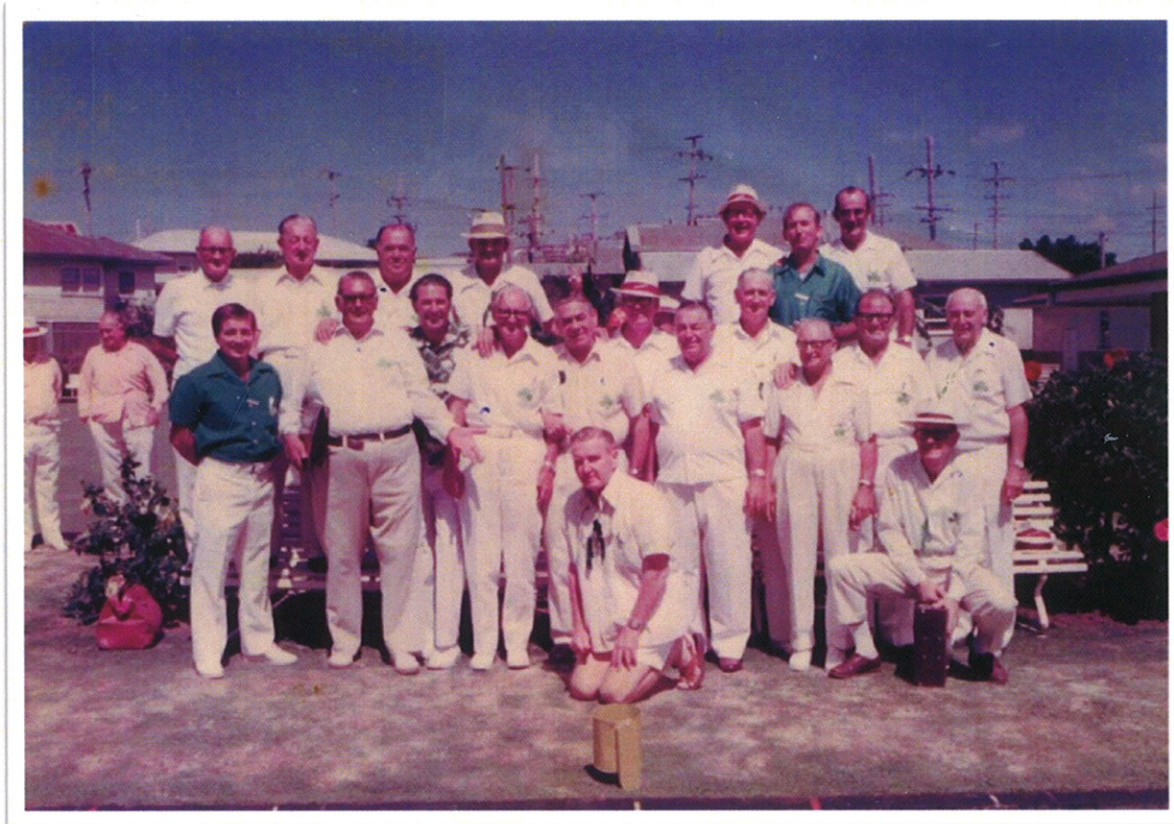
All Sports members (the "Micks") gathered to celebrate St Patrick's Day 1968

They held big event days at the club, such as St Patrick's Day.