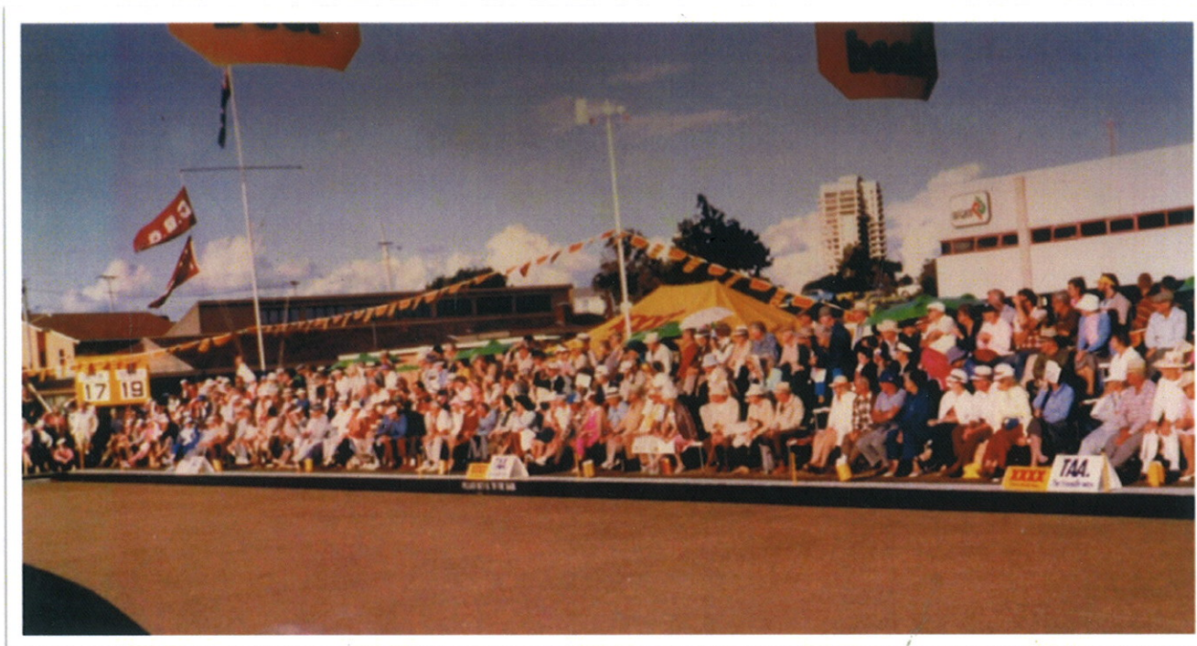
Section of crowd on that momentous day