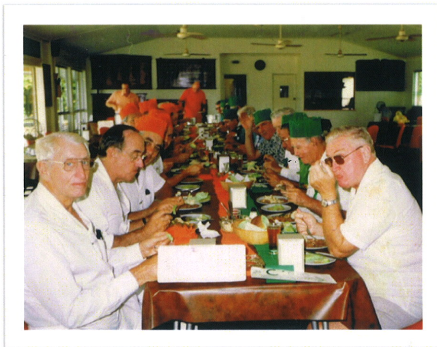
Celebrating St Patrick's day - the orange and the green